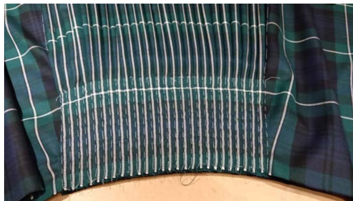
Pleats In - Modern Forbes Kilt Being Made the Traditional Way, By Hand