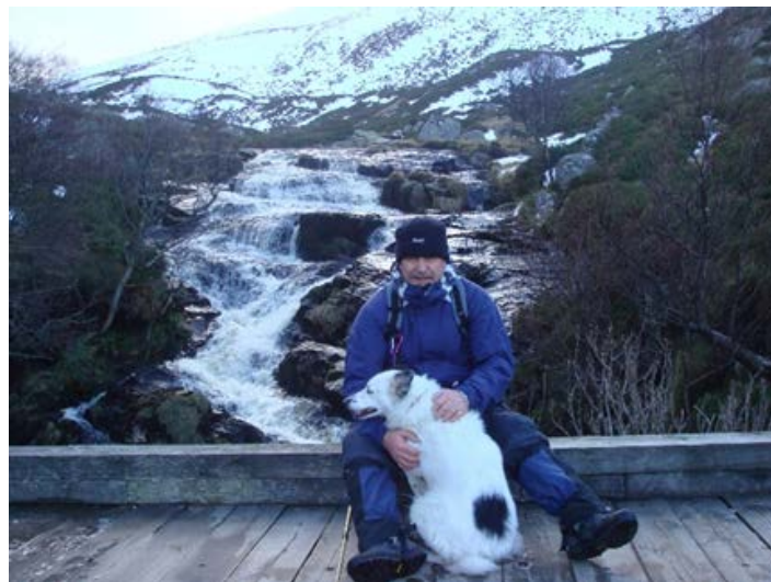
Our Dab and Myself Up in the Hills, Was Bloomin Cold That Day