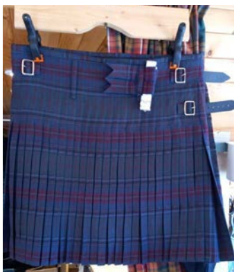
Bonny Grey Stewart Box Pleat Kilt and Flashes