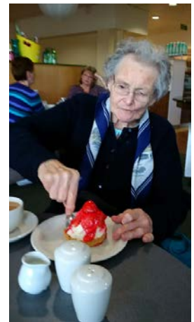
Our Mum